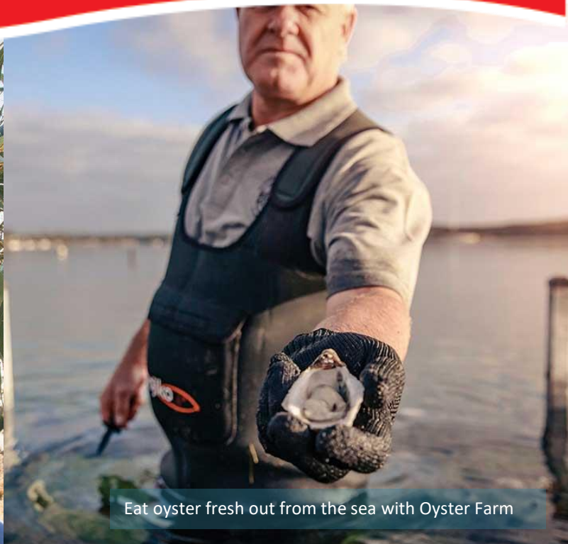
Eat oyster fresh out from the sea with Oyster Farm