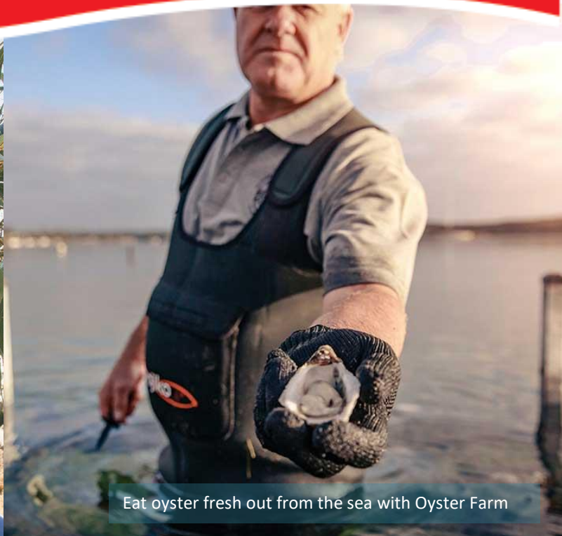
Eat oyster fresh out from the sea with Oyster Farm

From Mikkira Station, we take you back to the Port Lincoln Airport for your late departure.