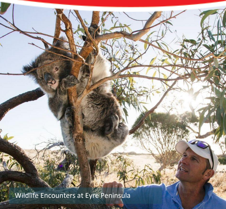
Wildlife Encounters at Eyre Peninsula