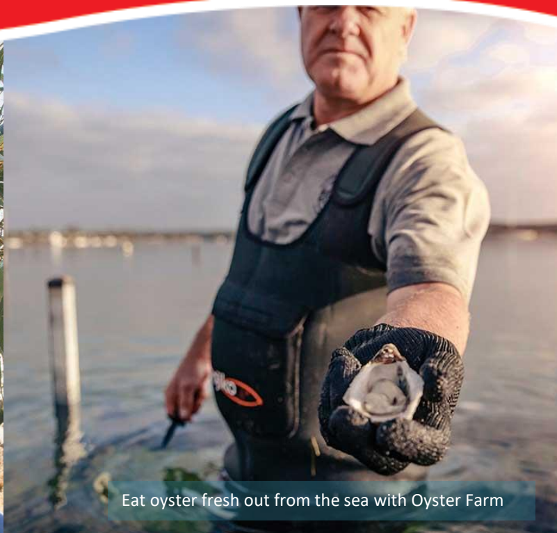
Eat oyster fresh out from the sea with Oyster Farm