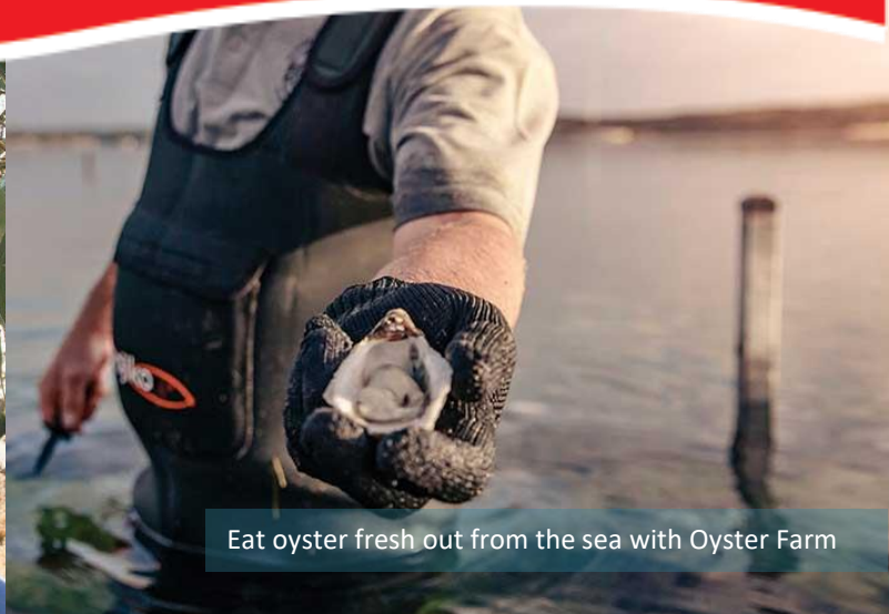
Eat oyster fresh out from the sea with Oyster Farm